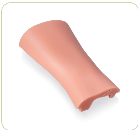
ULTRASOUNDABLE REPLACEABLE TISSUE