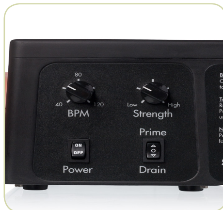
Adjustable Pulse & BPM